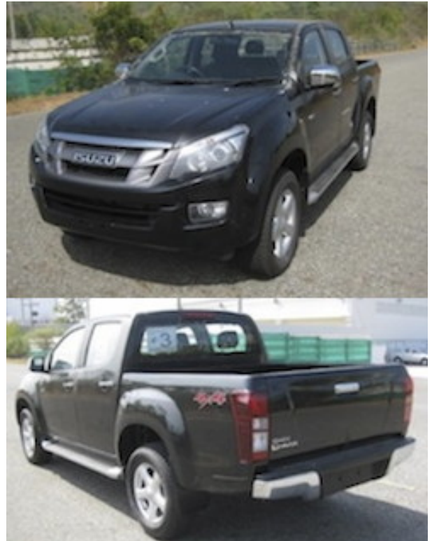
Isuzu D-Max 4x4 Crew Cab