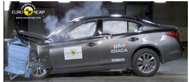
Frontal offset test at 64 km/h (Euro NCAP)

Note: The 2WD diesel left-hand-drive European model was tested by Euro NCAP. ANCAP was provided with information which showed that the results also apply to all 2WD variants.