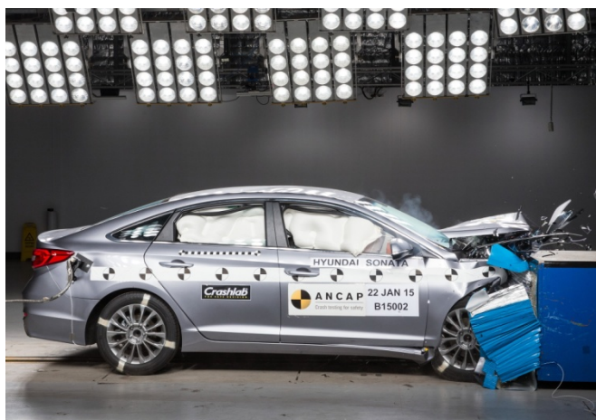
Frontal offset test at 64km/h