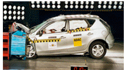
Offset crash test at 64km/h (hatch)