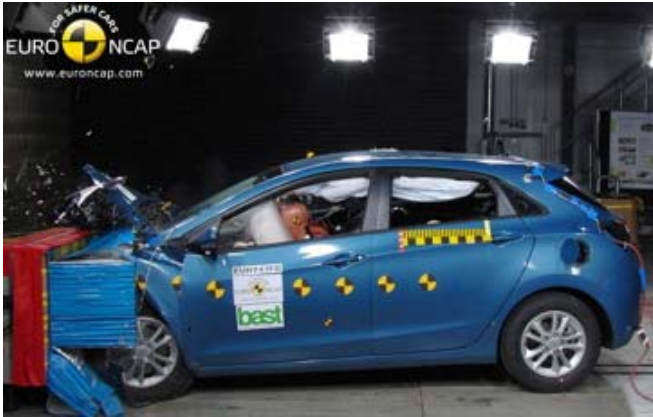
Frontal offset test at 64km/h (Euro NCAP)