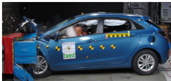
Offset crash test at 64km/h

From June 2012 Front+side+head+knee airbags