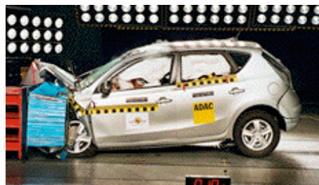
Offset crash test at 64km/h