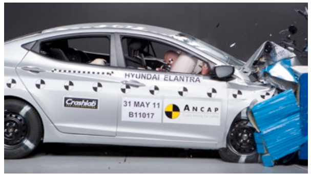
Offset crash test at 64km/h