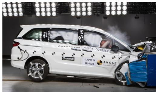
Frontal offset test at 64 km/h