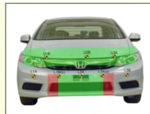
Adult leg impact (upper and full legforms)