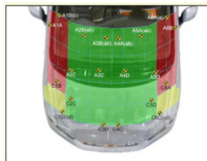
Child and adult head impact