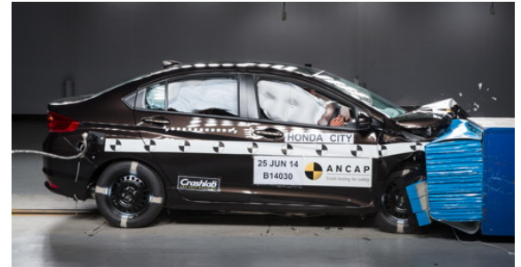
Frontal offset test at 64 km/h