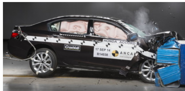
Frontal offset test at 64 km/h