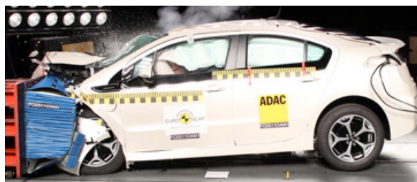
Offset crash test at 64km/h (Euro NCAP)