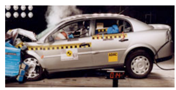
Offset crash test at 64km/h

The vehicle was eligible for an optional pole impact test, since it had head-protecting side airbags and scored four points for the head in the side impact test. The manufacturer decided to go ahead with the pole test and the vehicle earned a further two points.