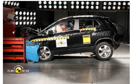
Frontal offset test at 64 km/h

Note: The front-wheel-drive, diesel left-hand-drive European model was tested by Euro NCAP. ANCAP was provided with information which showed that the Euro NCAP results apply to all Australasian variants.