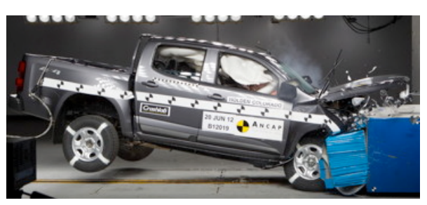
Offset crash test at 64km/h (Colorado Utility)