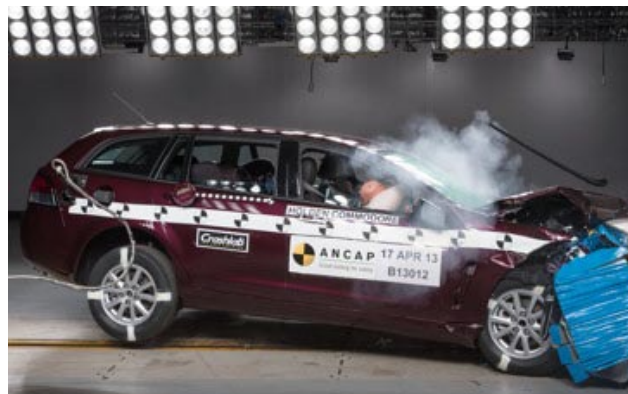
Frontal offset test at 64 km/h (Commodore wagon)

Note: This rating is based on ANCAP tests of the Holden Commodore. ANCAP was provided with information which showed that the Caprice provides comparable occupant protection to the Commodore.