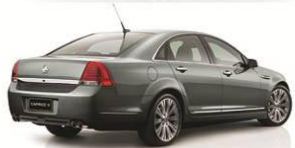
Holden Caprice WN