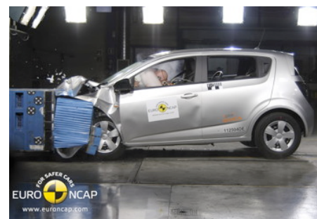
Frontal offset test at 64 km/h (Euro NCAP)

Note: The left-hand-drive European model was tested by Euro NCAP. ANCAP was provided with information which showed that the Euro NCAP results apply to the Australasian model.