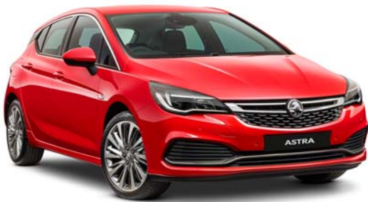
Holden Astra Hatch