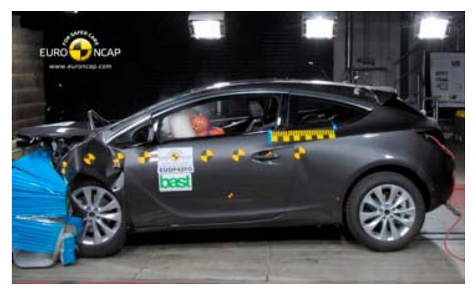
Frontal offset test at 64km/h (Euro NCAP)