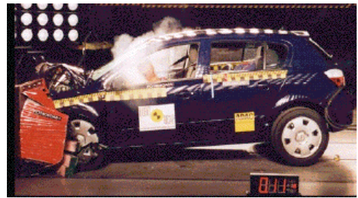
Offset crash test at 64km/h