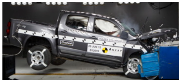
Offset crash test at 64km/h (Colorado Crew cab)

From June 2012 Front+side curtain airbags