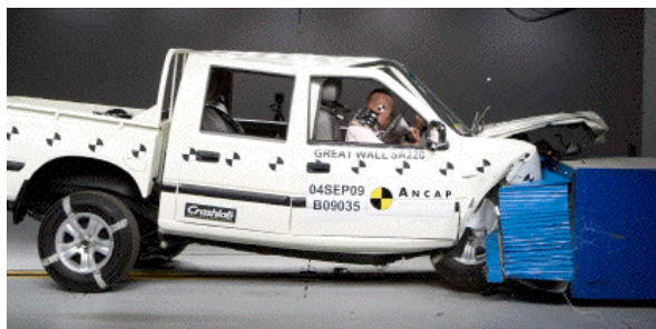
Offset crash test at 64km/h