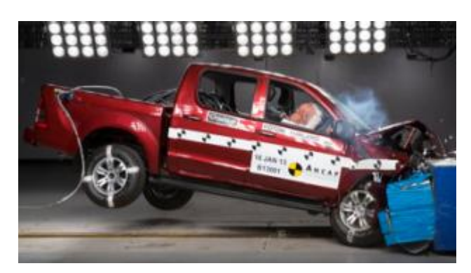
Frontal offset test at 64 km/h