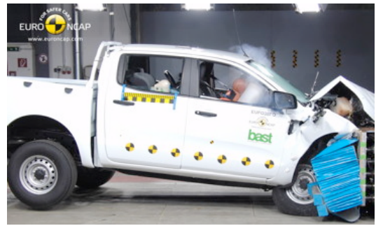
Offset crash test at 64km/h