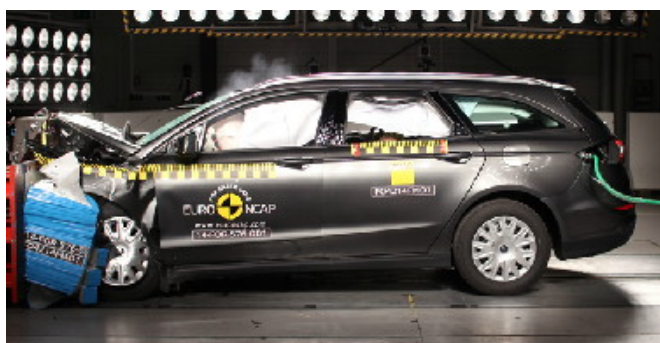
Frontal offset test at 64km/h (Euro NCAP wagon)