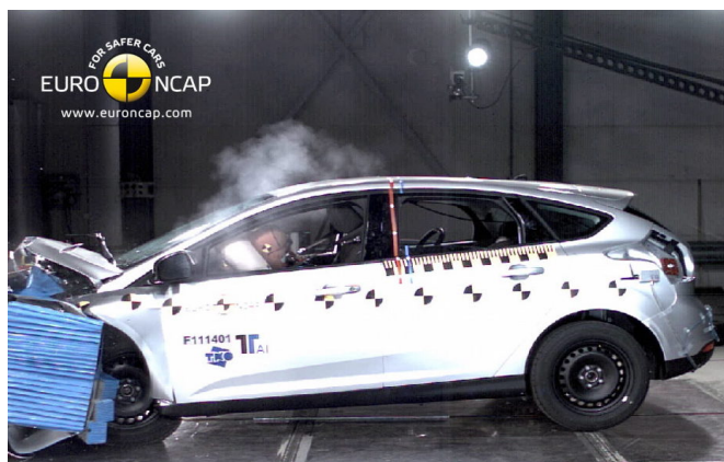
Frontal offset test at 64km/h (Euro NCAP)