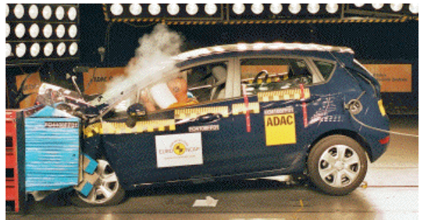
Offset crash test at 64km/h (5 door hatch)