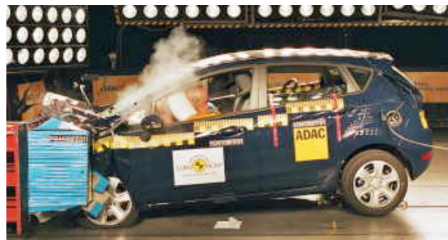
Frontal offset test at 64 km/h (Euro NCAP)

Note: The left-hand-drive 5-door hatch with 1.25 litre petrol engine was tested by Euro NCAP. ANCAP was provided with information which showed that the Euro NCAP results apply to all Fiesta variants with 7 airbags.