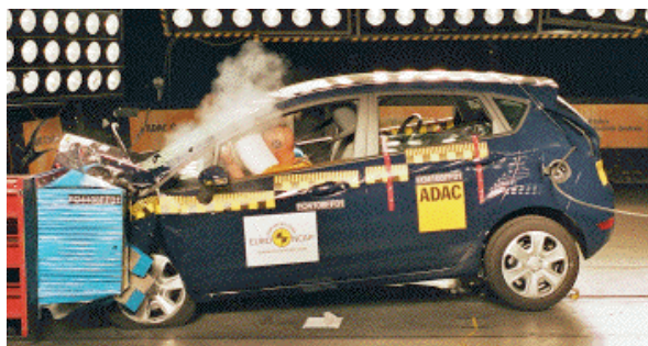
Offset crash test at 64km/h