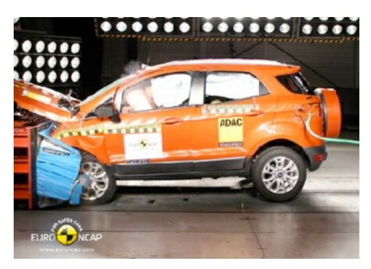
Frontal offset test at 64 km/h (Euro CAP)

Note: The diesel left-hand-drive European model was tested by Euro NCAP. ANCAP was provided with information which showed that the Euro NCAP results apply to all Australasian variants.