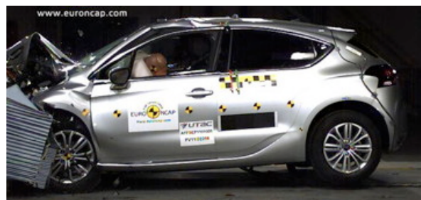
Offset crash test at 64km/h (Euro NCAP)