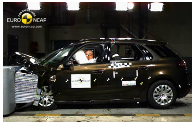
Frontal offset test at 64 km/h (Euro NCAP test of C4 Picasso)

Note: The diesel left-hand-drive European C4 Picasso was tested by Euro NCAP. Euro NCAP extended the C4 Picasso rating to the Grand Picasso. ANCAP was provided with information which showed that the Euro NCAP results apply to all Grand Picasso variants.