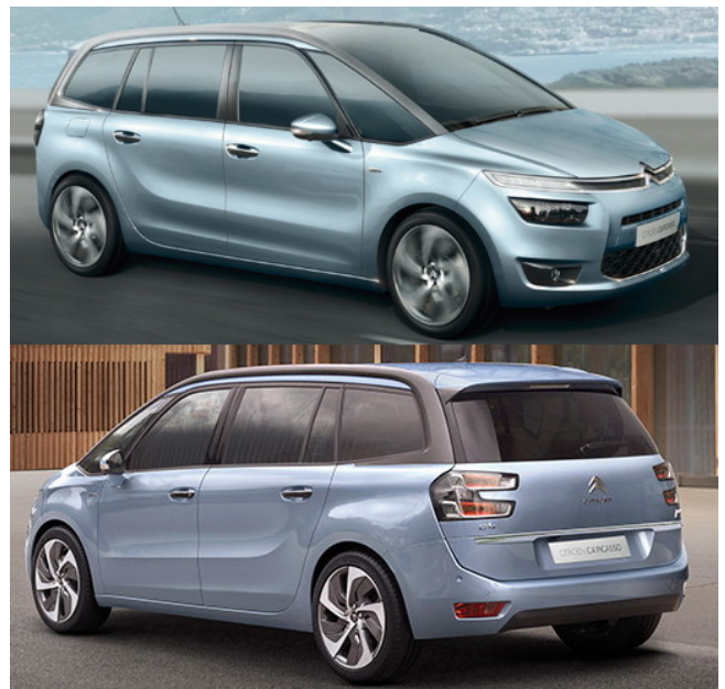
Citroen C4 Grand Picasso