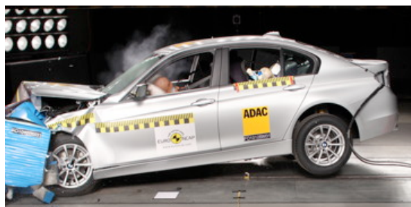
Offset crash test at 64km/h