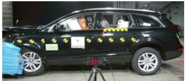
Offset crash test at 64km/h