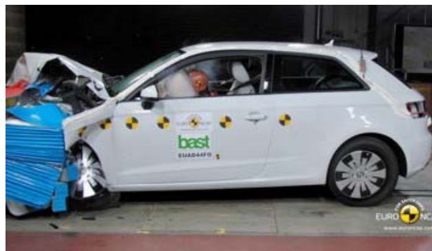
Frontal offset test at 64 km/h (Euro NCAP)

Note: The left-hand-drive European 3 door hatch was tested by Euro NCAP. ANCAP was provided with information which showed that the Euro NCAP results apply to all Australasian variants, including sedans and 5 door hatches.