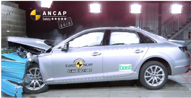
Frontal offset test at 64km/h