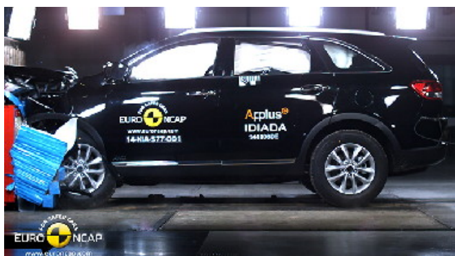
Frontal offset test at 64km/h (Euro NCAP)